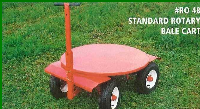
#RO 48 STANDARD ROTARY BALE CART